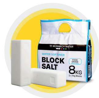
Block salt can be used for Ultra HE only