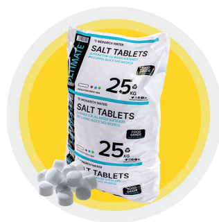
Tablet salt for Ultra HE & Premio HE