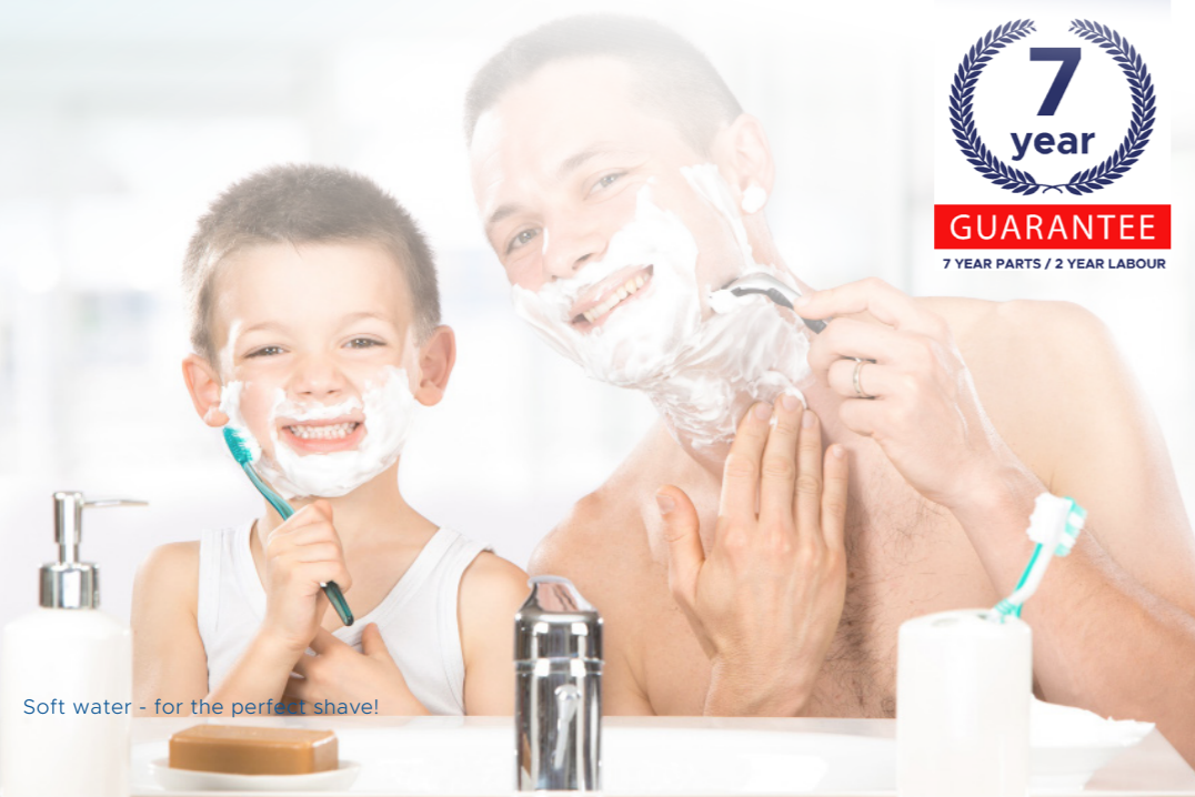
Soft water - for the perfect shave!

*7 year parts with 2 year labour. Additional warranty packages are available.