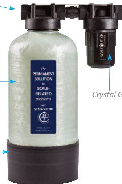
Crystal Guard Post Filter