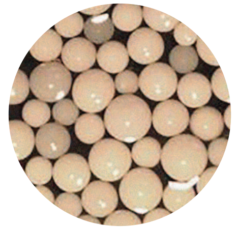
Ceramic Beads (CBT)

These special crystals once created (permanent), cannot form as hard scale on surfaces including heating coils and elements, fittings, or the inside of pipes etc.