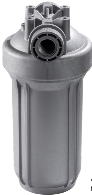
Anti-microbial filter housing

Combining whole-house scale prevention with premium filtered drinking water at every tap.